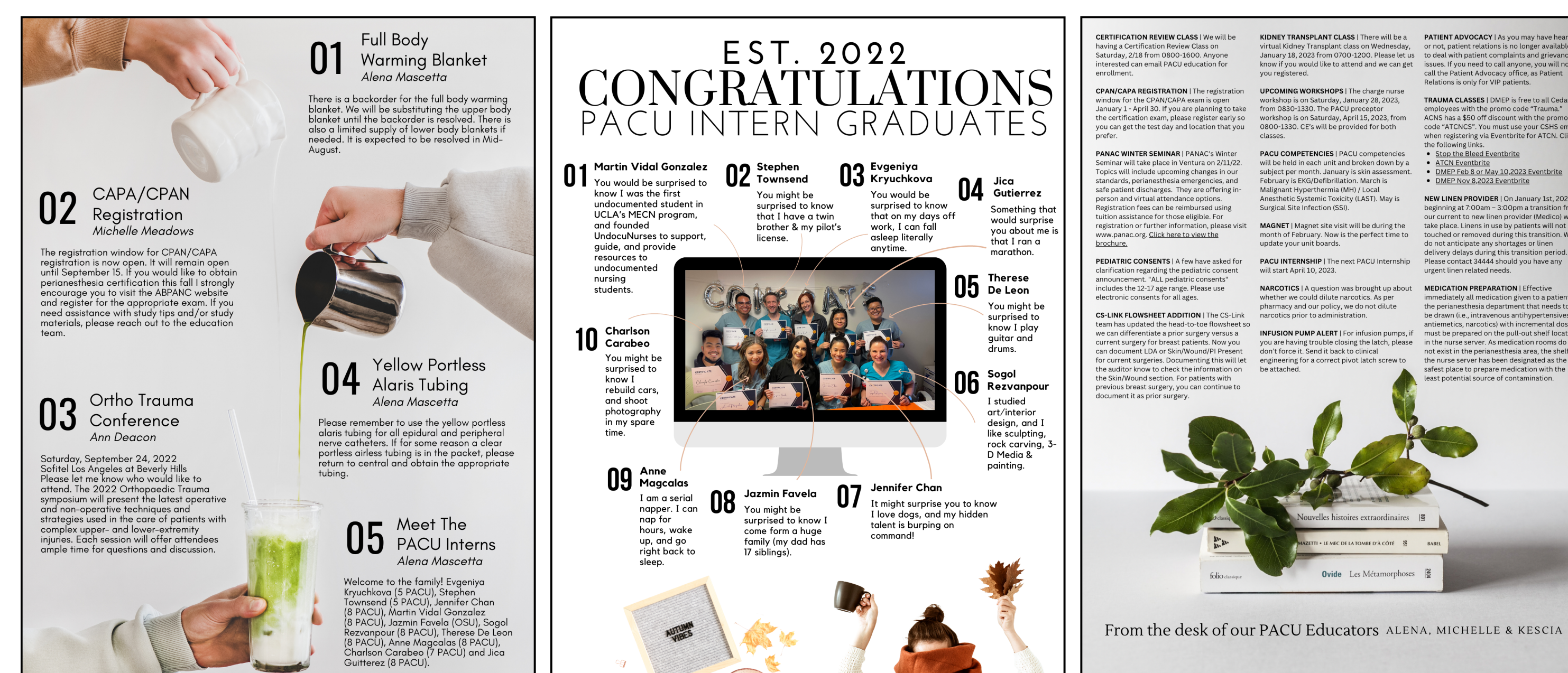
Valuable content To prioritize the staff experience, layouts are filled with valuable content that embraces variety and encourages professional presence.