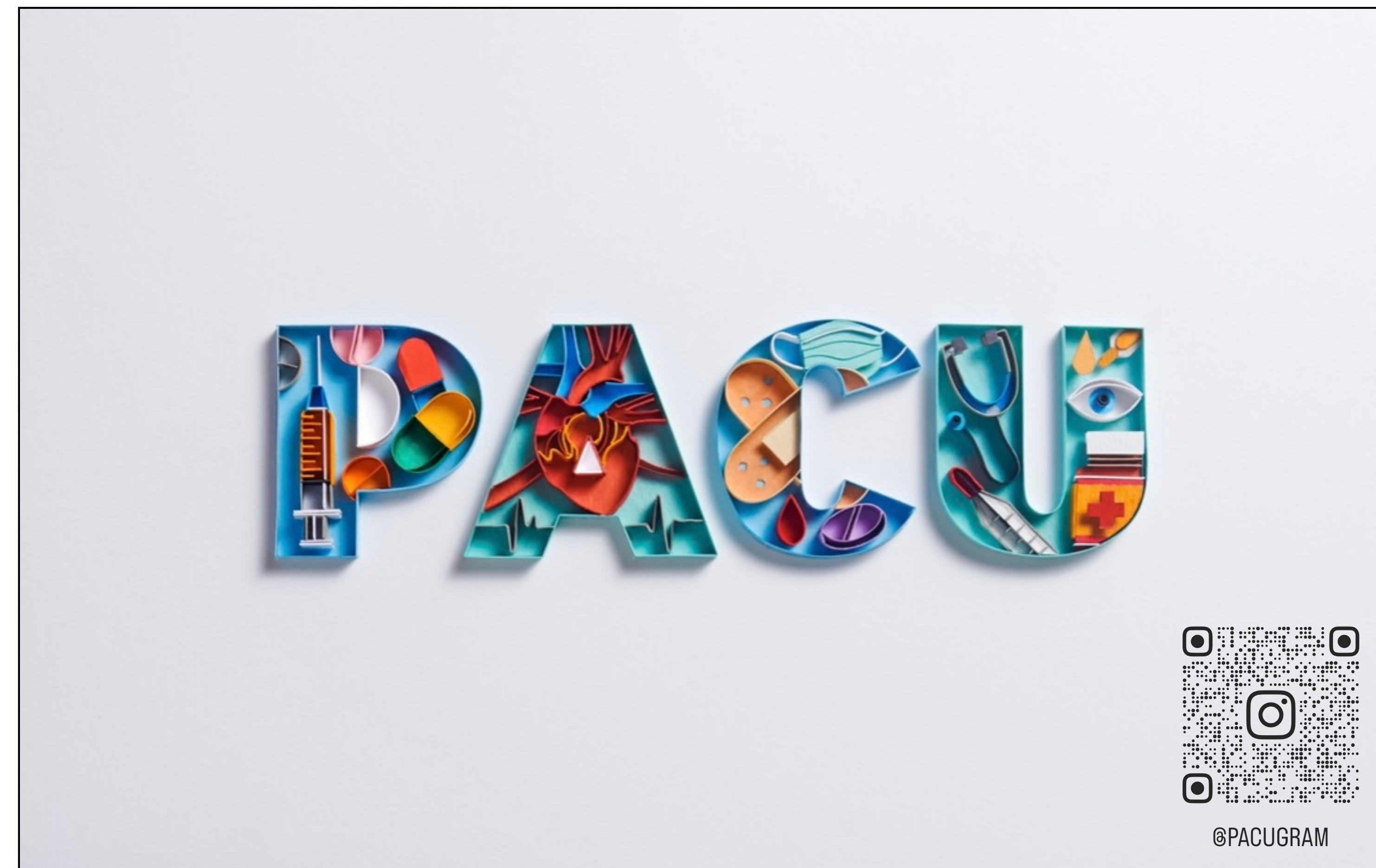
PACUGRAM The PACUGRAM newsletter is accessible through internal email and on the Instagram platform. Scan the QR code above to preview its archived issues.

Since there is a level of intrinsic motivation for staff to share elements that they enjoy in the workplace, there is always an abundance of interactively inspiring content. The editor-in-chief creates visually stunning and informative layouts, which are released monthly.